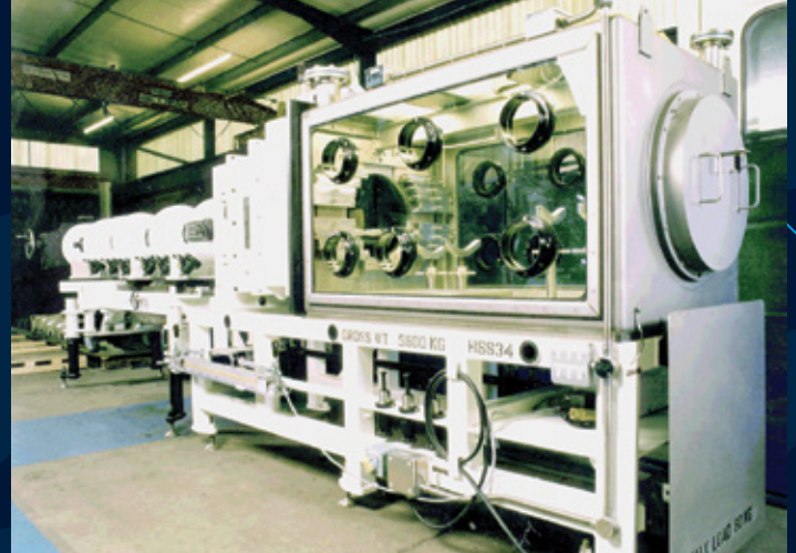
High integrity containment for maintenance of Master Slave Manipulator, Sellafield SDP