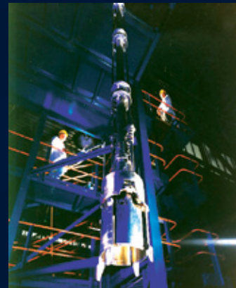
Fuel element handling machine Dungeness B