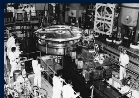
Institute Laue Langvin, remote 6 axis underwater reactor cutting machine

The Aquila team has many years of experience in the nuclear industry which includes the specialist areas of containment, shielded systems, remote handling and nuclear packaging.